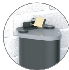
SIMPLE LOCK SECURITY